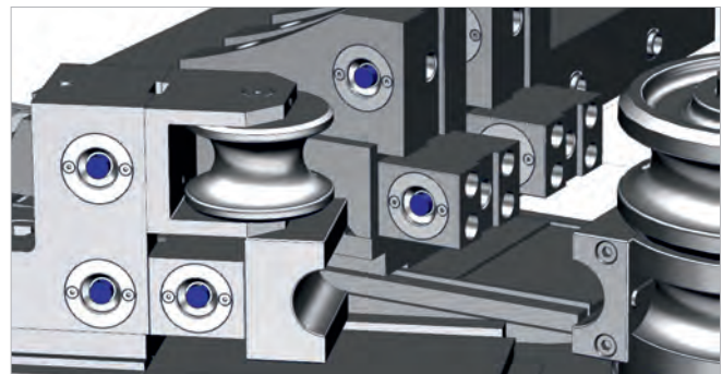
▲ Quick-change tool mounting system on a RBV 60 R (two-level tool structure)