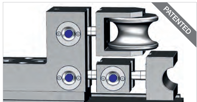
▲ Changing tools with just one "click"