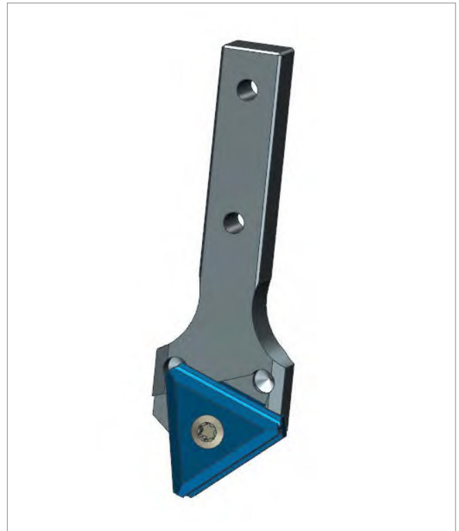
▲ Coiling plate holder with coiling plate.