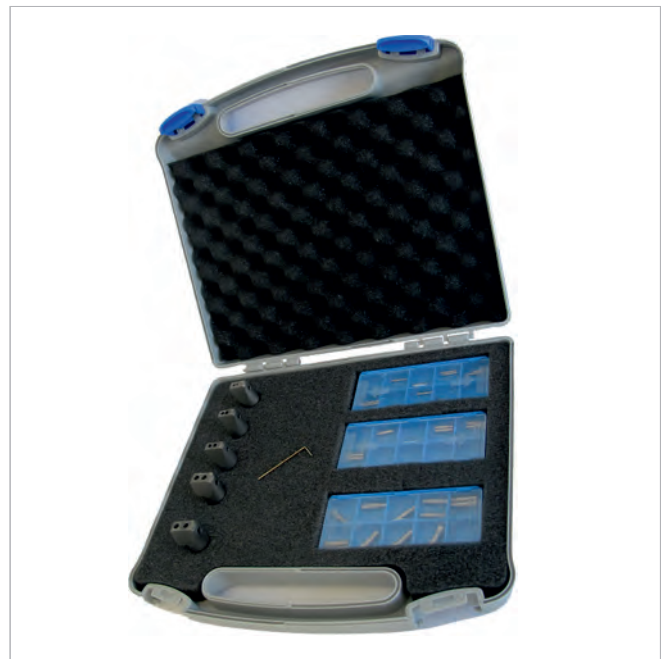
▲ Tool box