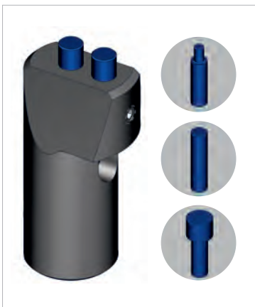
▲ Modular Coiler Set with pins

The modular coiler set for Wafios machines of series FMU and FMK allows through its free configurability the highest possible flexibility during the production process for an attractive price. Via the easy configurability, short set-up times and the comfortable replacement of worn out parts cuts cuttings can be realized quickly.