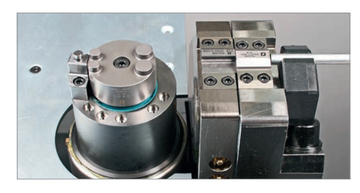
▲ Standard 4-pin bending tool

The machine design engineered by WAFIOS with rotating infeed unit and fixed bending head guarantees highest production output while maintaining outstanding quality.