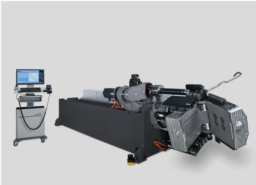
Fig.1 WAFIOS RST 28

Visit WAFIOS at the wire & Tube show in Düsseldorf on June 20 – June 24, 2022 Hall 10 – booth F 22/40 and hall 5 – booth A21/A22. For our complete exhibition program under the motto "Future Forming Technology" go to www.wireandtube.wafios.com . Arrange a meeting with us at the fair online today.