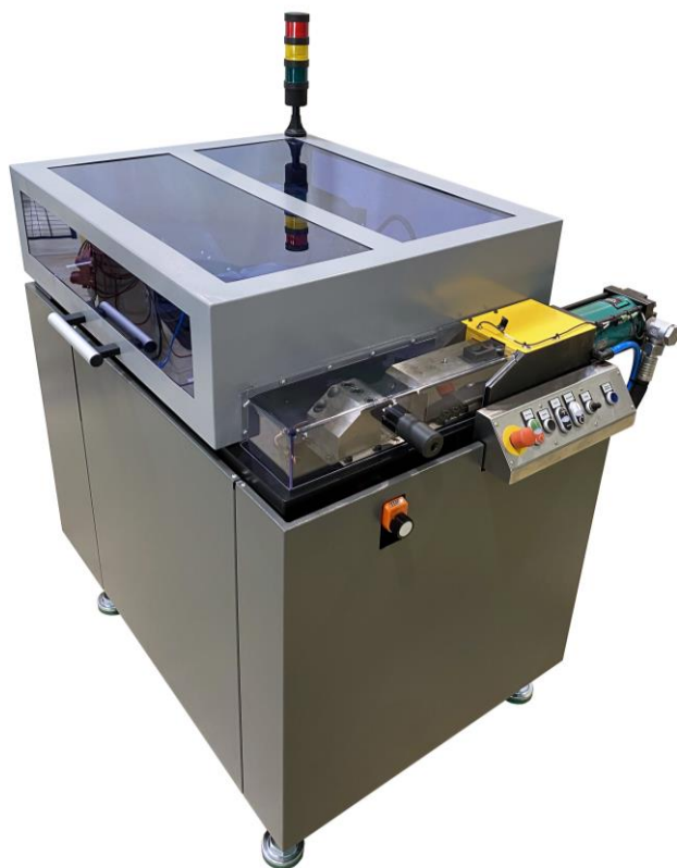
Fig. 3 WAFIOS Tube Automation RU 12 compact