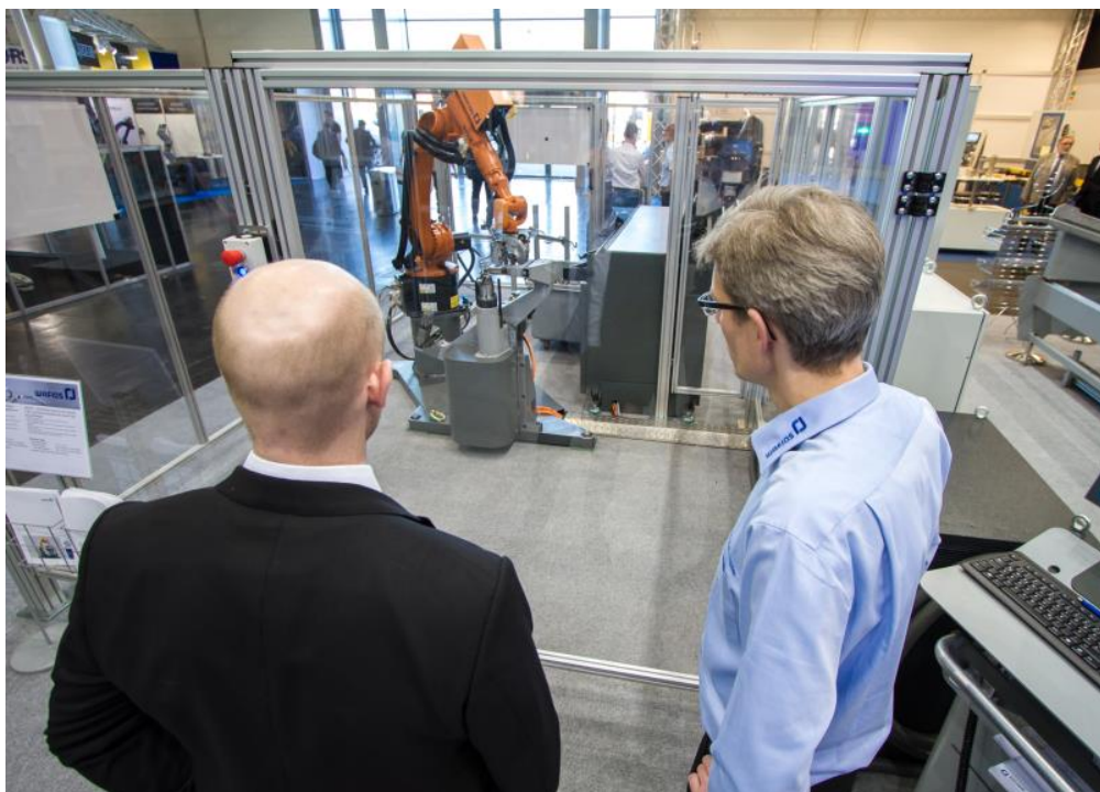
Fig. 4 WAFIOS impressions of Tube Düsseldorf