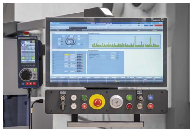
▼ Control panel with WPS 3.2 EasyWay