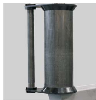
▲ Heavyweight arm