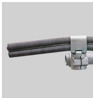
▲ Deflection version

High production output and a long service life will save money and shorten the amortization time of your investment.