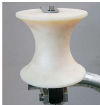
▲ Deflection version