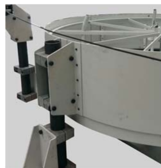
▲ Protection for oil hardened wire