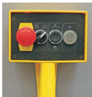
▲ Hand-held operating device