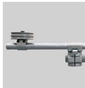
▲ Deflection version