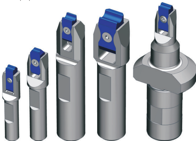
▲ Holder with coiling insert - types