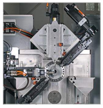
▲ 2-Axes spring and wire forming device FMU 25+