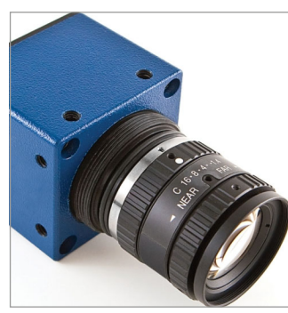
▲ Optical measuring system

▼ FMU 32+ with protective roll-up door on the side (option)