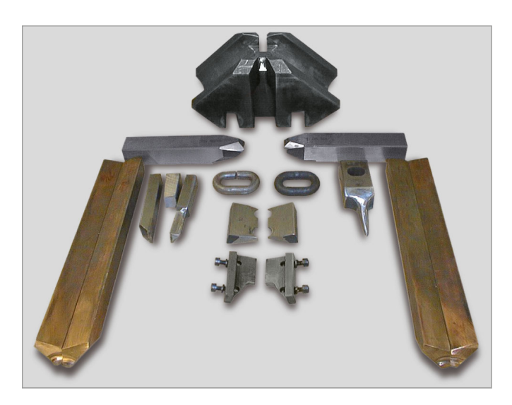
▲ Set of tools for KEH

KEH-series chain welding machines are used for the resistance butt welding of bent round steel chains with notching on the chain link ends. The welding burr on the chain link is completely deburred by the chain welding machine.