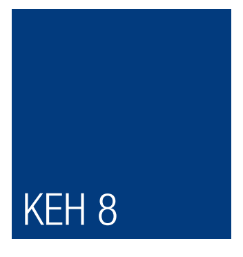
▼ KEH 8 – Back side