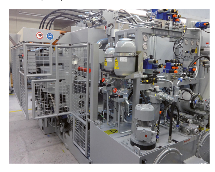
▼ KEH 8 – Hydraulic power unit