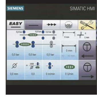
▲ Graphical operator guidance