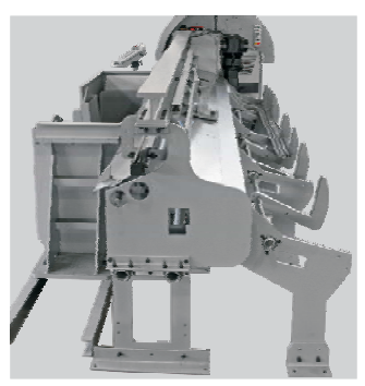
Anbau für beidseitigen Stabausfall