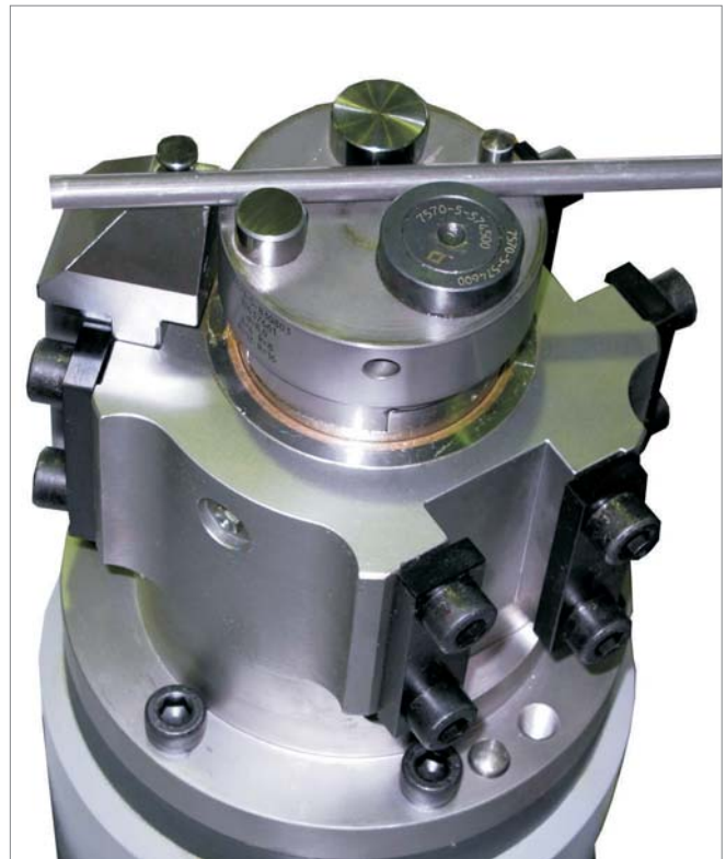
▲ Multi-radii tool BM 60