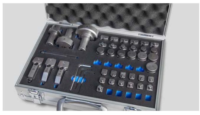
\, \underline{\hspace{1cm}} \, Set of tools with bending mandrel holders and bending pin holders in three different sizes (G1, G2 and G3) as well as the according bending mandrel and bending pin inserts

wire. Bending pin inserts with coiling rollers can be used to enhance the wire surface of stainless steels as well as of conventional steels. These bending pin inserts for wire diameters of 2-13 mm save costs and set-up time since there is no need to purchase and install an entire, new tool. Bending pin inserts are available individually or as an extension set.