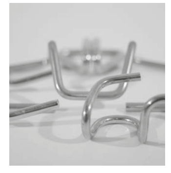
WAFIOS AG Silberburgstraße 5 72764 Reutlingen, Germany