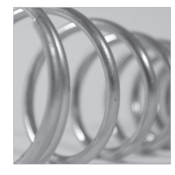
WAFIOS AG Silberburgstraße 5 72764 Reutlingen, Germany