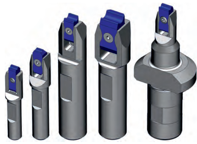
▲ Holder with coiling insert - types