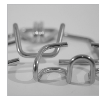
WAFIOS AG Silberburgstraße 5 72764 Reutlingen, Germany