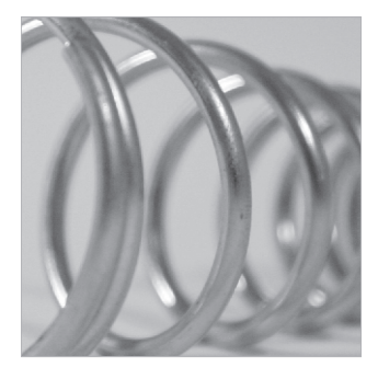
WAFIOS AG Silberburgstraße 5 72764 Reutlingen, Germany