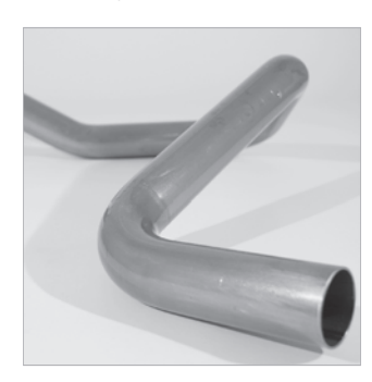
WAFIOS AG Silberburgstraße 5 72764 Reutlingen, Germany