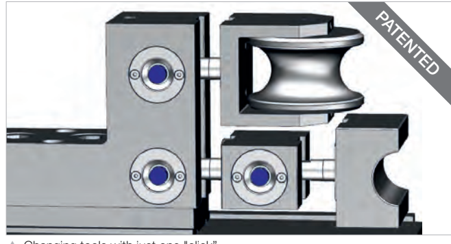
▲ Changing tools with just one "click"