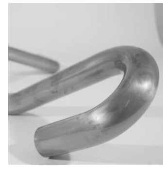
WAFIOS AG Silberburgstraße 5 72764 Reutlingen, Germany