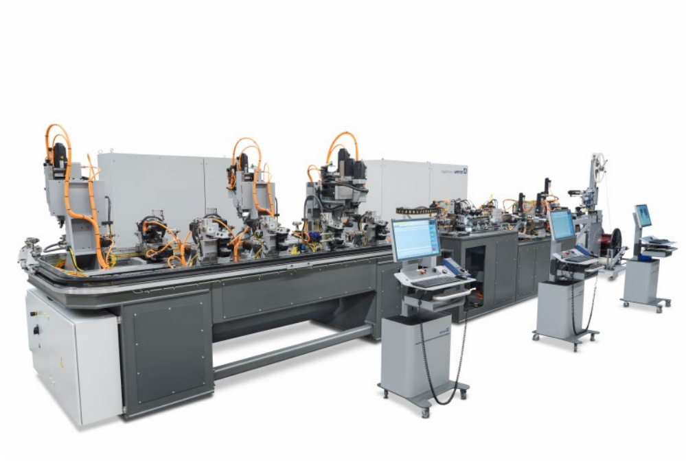
Fig. 1 SpeedFormer