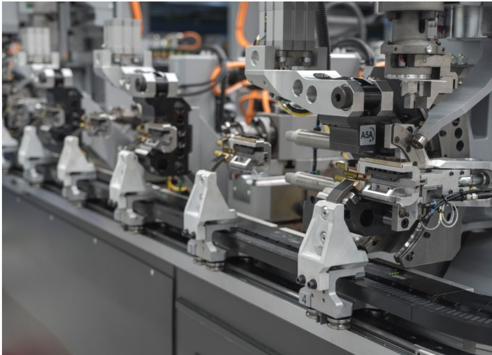
Fig. 3 SpeedFormer, subsequent bending process